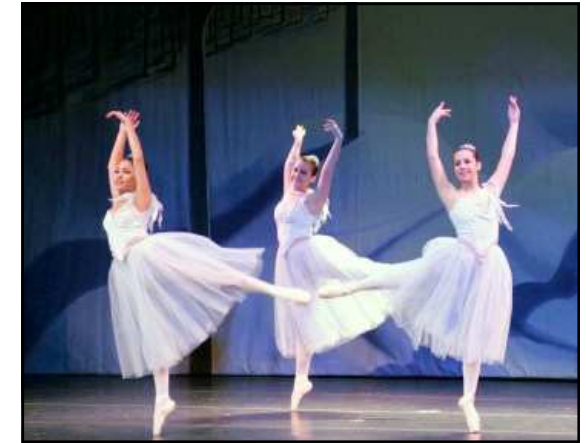
Snow Scene - Nutcracker